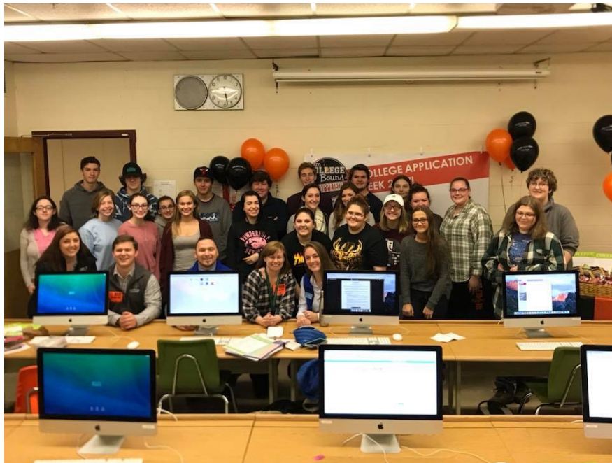
Students, volunteers, and staff take a moment to celebrate at Keene High School's event!

"I applied to eleven colleges. I would not have been able to afford to apply to that many." - Student