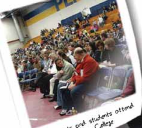
1200 parents and students attend Destination College